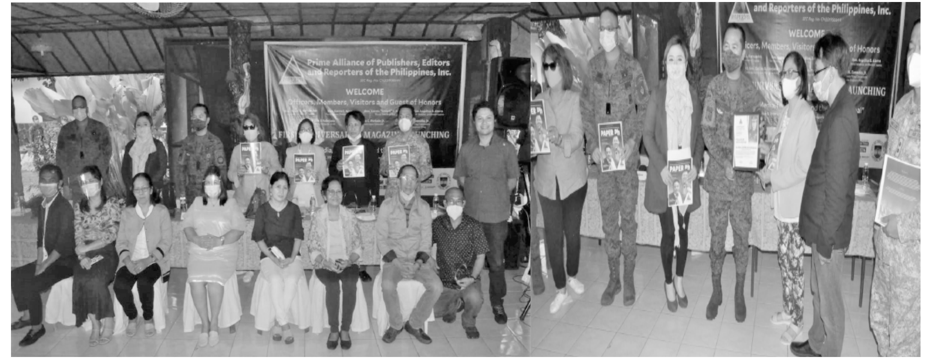
(From page 1)

Academy Class of 1987 and a medal of valor recipient, cited the media's critical role in this time of pandemic as well as in curbing terrorism.